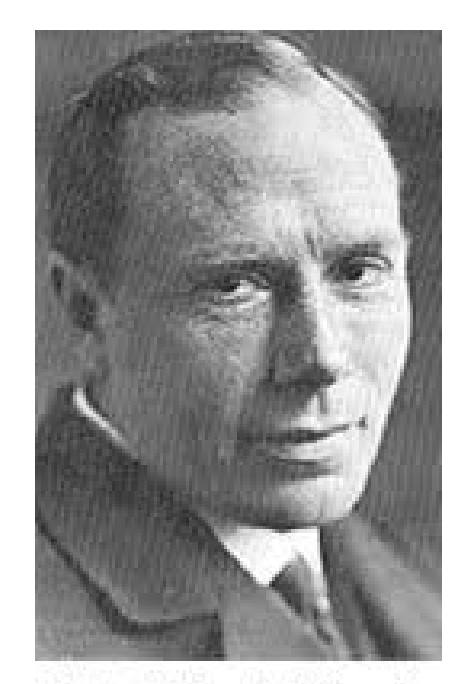
Reginald Crundall Punnett