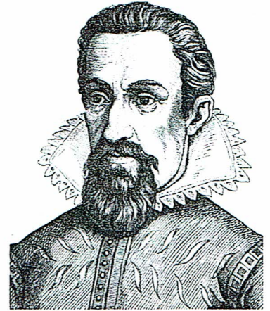
Johannes Kepler (1571-1630)