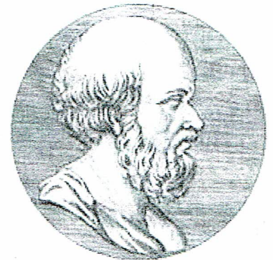
Eratosthenes (276-194 BC)