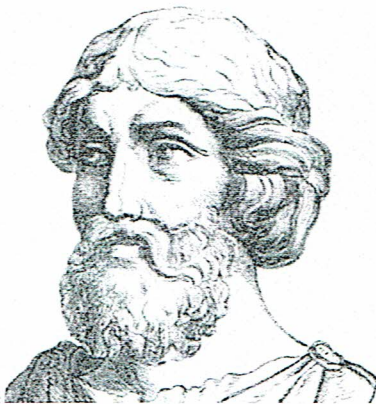
Aristarchus (312- 230 BC)