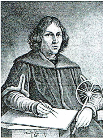
Nicolaus Copernicus (1473-1543)