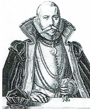
Tycho Brahe (1546-1601)