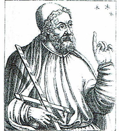
Claudius Ptolemy (AD 141)